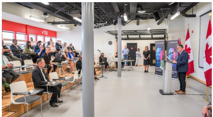
Innovation Commons – Lecture Hall