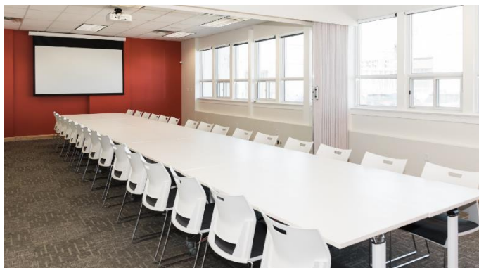
Innovation Commons – Seminar Rooms