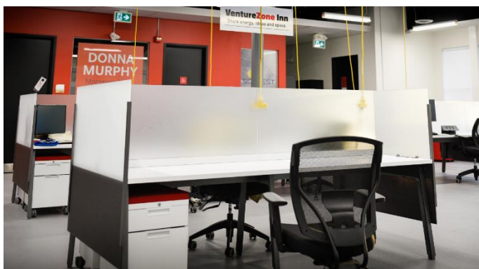
The VentureZone Co-Working Space