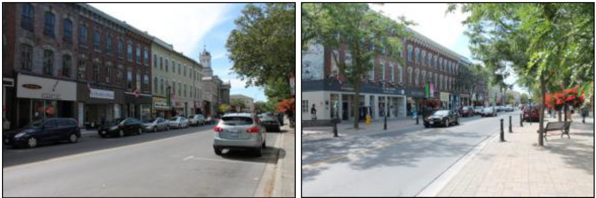
Examples of the commercial street wall and streetscape.