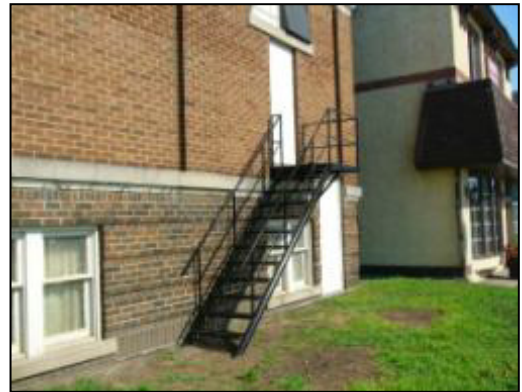
New entrances should be installed on secondary building elevations.