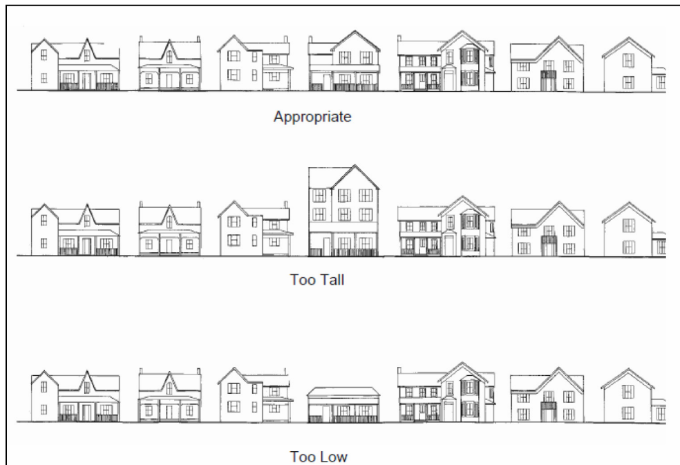
Examples of building height and massing that is appropriate and inappropriate.