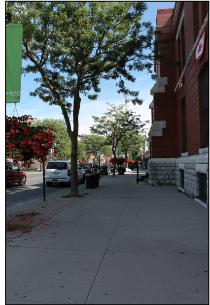
Example of current street tree planting along King Street