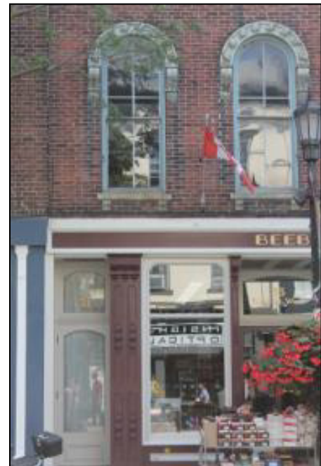
Example of a storefront showing the various components and features.