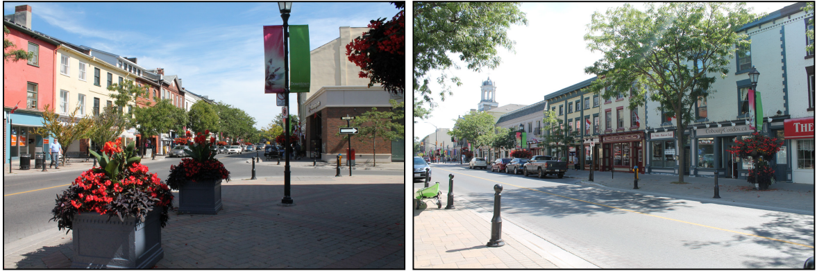
Examples of views along King Street within the Commercial Core HCD.