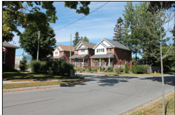
Infill that fits within the neighbourhood but is also distinct from historic homes.