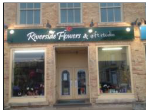
Examples of appropriate building signs that are either unlit or lit with external lighting.