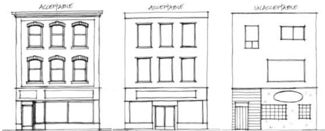
Examples of acceptable and unacceptable window and door patterns for new construction within the commercial street wall.