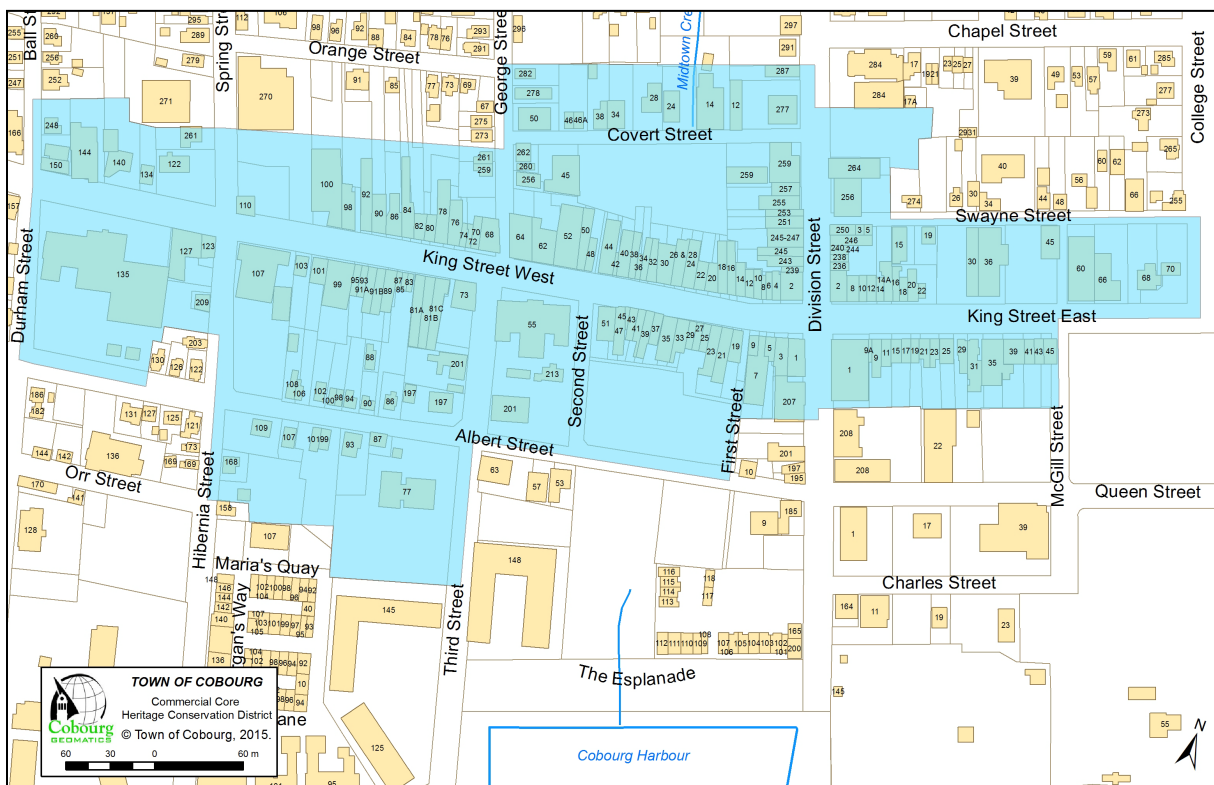
Figure 1: Commercial Core Heritage Conservation District

The Commercial Core HCD includes properties that front onto both sides of the section of King Street West from Durham Street to College Street, as well as some properties located on George Street, Covert Street, Division Street, Swayne Street, Albert Street, Third Street, and Spring Street. A map showing the HCD ( Figure 1 ) is located below: